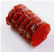
Brisket - 5/18LNS - 5/20LNS