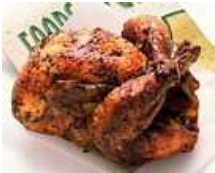
Rotisserie Chicken - 6" Polyester Poultry Loops

The following is a description of the numbering system that uses to size and catalog the netting we manufacture: