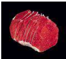
Boneless Rump Roast - 5/18LNS - 5/20LNS