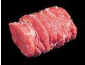
Leg of Veal - 5/16LNS - 5/20LNS

Lago Como No. 72 Col. Anahuac; Del. Miguel Hidalgo; México, D.F. 11320 Tel. 52-55-5386-3518