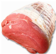
Shoulder of Veal - 5/16LNS - 5/20LNS