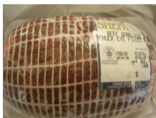
Boneless Chuck Roast - 5/18LNS - 5/20LNS