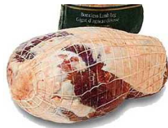
Leg of Lamb - 5/16LNS - 5/22LNS