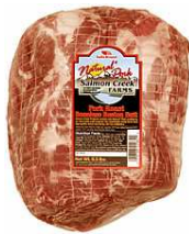
Boneless Boston - 5/18LNS - 5/22LNS